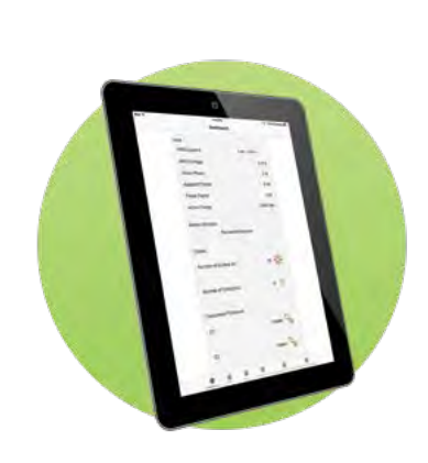
PDView App Turn your tablet or phone into a remote display. Raritan's PDView app provides at-the-rack display of all critical data.