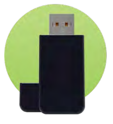
Quick Setup Use ordinary USB sticks to configure hundreds of PDUs in mere minutes. Save big on deployment time and costs.