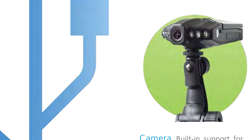
Camera Built-in support for USB cameras allow you to remotely monitor your racks or take a snapshot when doors are opened.