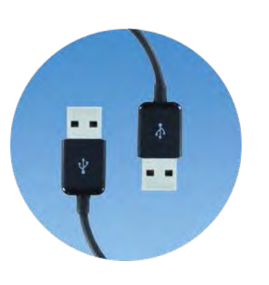
Cascading Easily cascade (daisy chain) multiple PDUs in a rack. Save money on IP drops, Ethernet ports, and patch ports.

While few vendors offer USB ports on their PDUs, or only offer firmware upgrade capabilities, Raritan USB ports can lower your capital expenditures, improve your power management capabilities, and give you greater control over your IT equipment racks! Our full-featured racks provide the following capabilities: