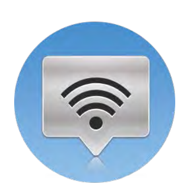
WiFi Run out of network drops? No problem. With USB WiFi, Raritan iPDUs can be networked without additional expense.