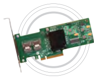
ThinkServer RAID 500 Adapter II OA89407

Increase your network bandwidth for better reliability.